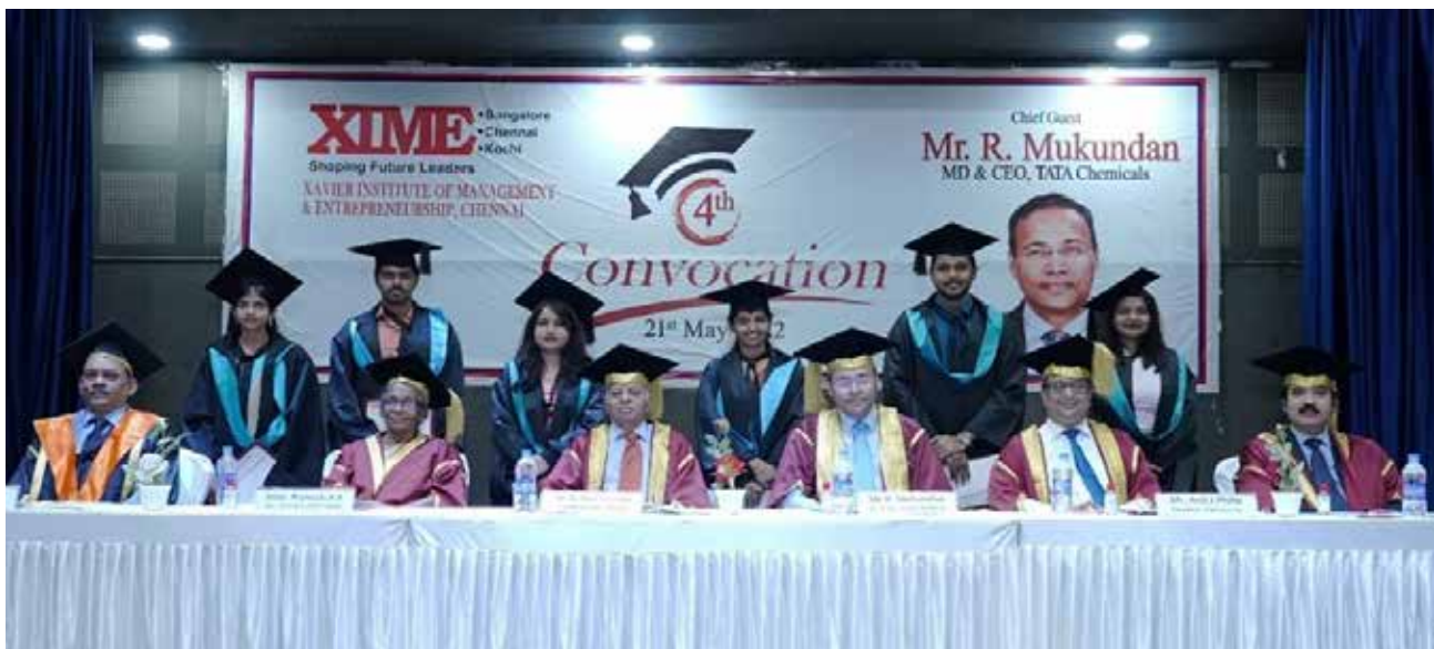
Winners of the excellence awards