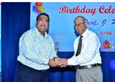
Glimpses from the event