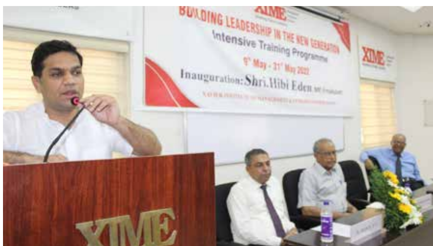
Inauguration of Leadership programme by Shri. Hibi Eden, MP, Ernakulam