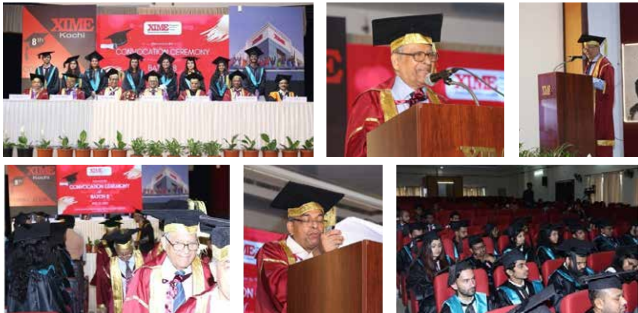
Moments during the Convocation