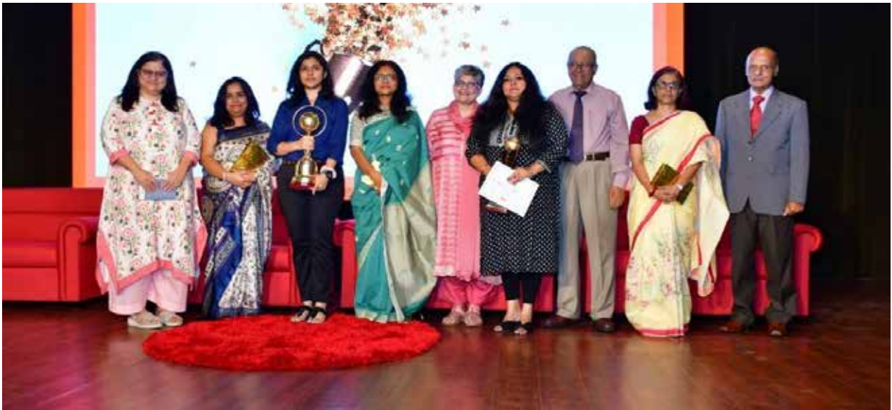
The winners of the 'Maria Philip Best Speaker competition' with the dignitaries