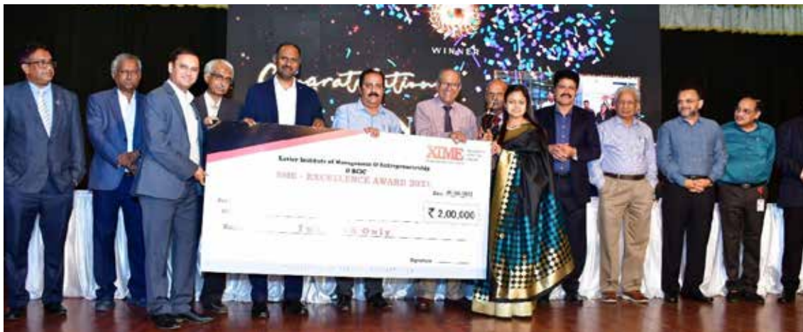
Ankit Arerospace Pvt Ltd. - The Winner of the SME Excellence Award